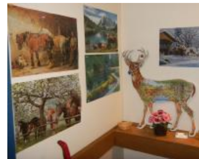
Puzzles and keepsakes outside of one of the suites.